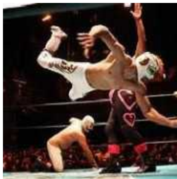
Lucha Libre Wrestling

Bring your boots---AND bring your “outside” voice as the Fayette County Fair in La Grange Texas reels in traditions, cultures, and heritage while having LOADS of fun and activities for all ages Thursday, August 30 – Sunday September 2. With all activities, events, entertainment with headliner Easton Corbin, agriculture, educational exhibits, parade, queen’s pageant, creative arts and so much more, there is no way to cover the Fayette County Fair in one day and that’s why there are season passes available for purchase and awesome food and drinks sold by non-profits throughout the days.